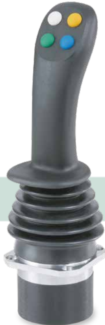
Mini EPVJ Joystick